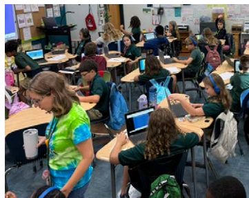
4th grade students are using I-Ready to practice their multiplication math facts.