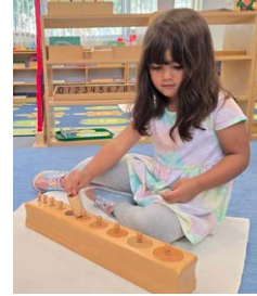
Preparing the mathematical brain