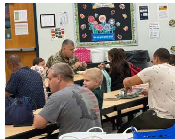
Titan students enjoy having their fathers and father figures come for "Breakfast with Dads"!