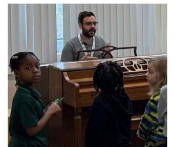
Students are excited to learn about music and what it means to them.