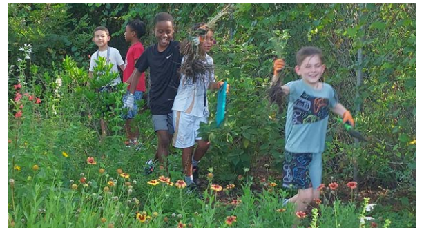
GateWay students enjoying the pollination garden planted by the Environmental Club last year! They saw bees, butterflies and dragon flies!