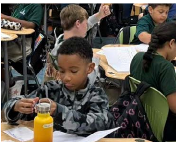
2nd graders are using their math manipulative to help build conceptual understandings of math.