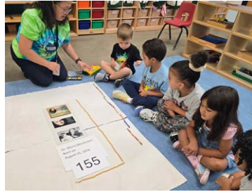
Celebrating Maria Montessori's birthday