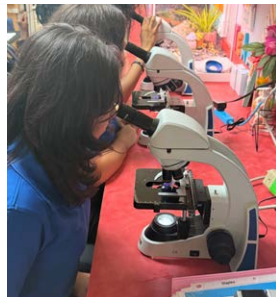
AP environmental science students are learning about stem structure.