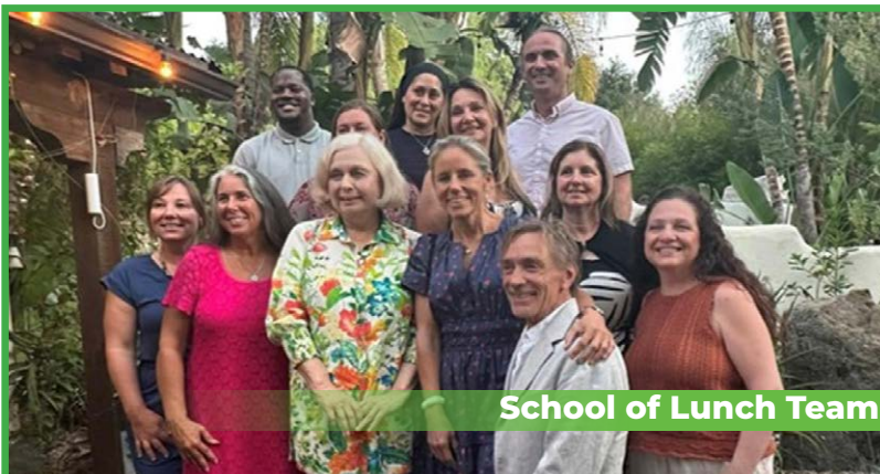
School of Lunch Team

Odyssey is not just a place of learning—it's becoming a beacon of health, vitality, and visionary thinking for schools nationwide. Join us as we lead the way, naturally!