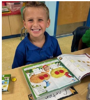
Kindergarten LOVES using manipulatives while learning numbers!