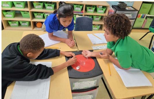
2nd graders using their Nature of Science skills to make observations during a science lab!