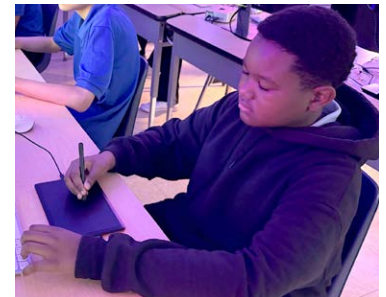
Commercial art students are working on yearbook and enjoying our new Mac computer lab!