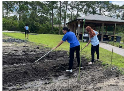
Farm students are preparing the soil while learning the foundational steps of sustainable agriculture.