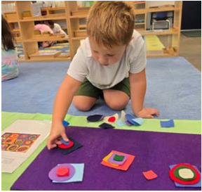
Working with Kandinsky shapes