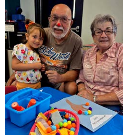
Grandparent's Day at MVG!